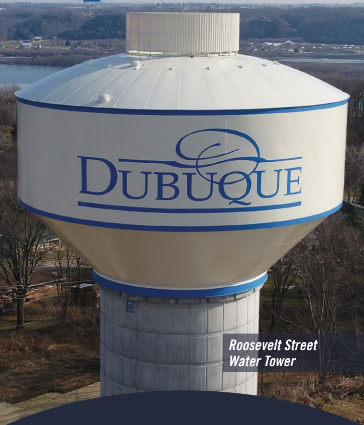
Roosevelt Street Water Tower