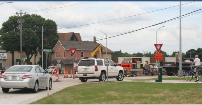
N. Grandview/Delhi St./Grace St. roundabout open to traffic, nearing completion