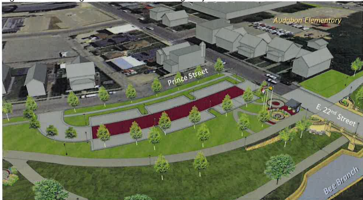
Figure 1. Rendering of the Trailhead Parking Project.

In order to secure the use of the DMATS funding for the project, a Request for Transportation Improvement Program Funds must be completed and submitted to the Iowa Department of Natural Resources. In addition, the City must provide an official endorsement of the project and written assurance that the improvements will be maintained for at least twenty (20) years.