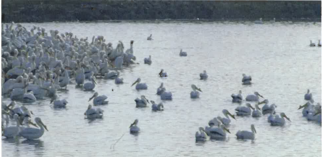
Figure 3. Photo of the migratory 16 th Street Detention Basin taken from the location of the proposed Basin Overlook.

In order to secure the use of the DMATS funding for the project, a Request for Transportation Improvement Program Funds must be completed and submitted to the Iowa Department of Natural Resources. In addition, the City must provide an official endorsement of the project and written assurance that the improvements will be maintained for at least twenty (20) years.