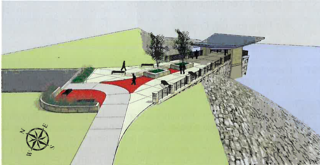
Figure 1. Rendering of the Lower Bee Branch Basin Overlook.

The Basin Overlook is to be located along the hike/bike trail system along the Bee Branch Creek Restoration Project, a trail system that will link the City's Mississippi River Trail system with the Heritage Trail that extends to Dyersville, Iowa. Figure 2 shows the location of the proposed Basin Overlook.