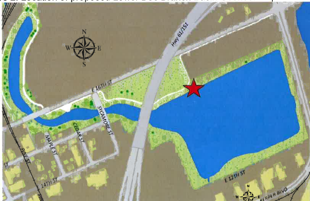
Figure 2. Location of proposed Lower Bee Branch Basin Overlook Improvements.

The Basin Overlook is to be located along the hike/bike trail system along the Bee Branch Creek Restoration Project, a trail system that will link the City's Mississippi River Trail system with the Heritage Trail that extends to Dyersville, Iowa. Figure 2 shows the location of the proposed Basin Overlook.