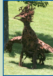
Fowl Play Tim Adams - Webster City, IA Weathered steel 8' x 7' x 8' 500 lbs. $2,600