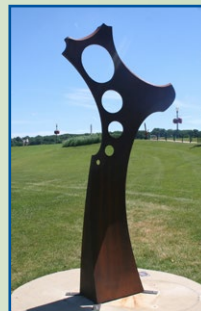
Standing Knife Edge Sam Spiczka - Sauk Rapids, MN Cor-ten weathering steel 3.5' x 8' x 1' 150 lbs. $12,500