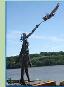
Letting Go Judd Nelson - Wayzata, MN 16g steel 28" x 66" x 32" 220 lbs. $7,200

Featured artists receive a $1,500 stipend for loaning their work for a year. All the pieces are for sale, but must stay in the exhibit through June 2018. Sales price does not include delivery and installation of the sculpture to the buyer's site.