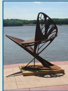
Wings of Change Hilde DeBruyne - Cumming, IA rusted steel, high quality welded, plasmacut wings 4.5' x 6' x 4.5' 350 lbs. $14,000

Featured artists receive a $1,500 stipend for loaning their work for a year. All the pieces are for sale, but must stay in the exhibit through June 2018. Sales price does not include delivery and installation of the sculpture to the buyer's site.