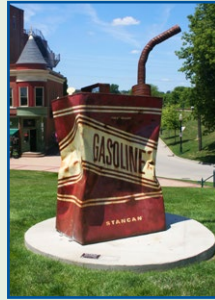
Juice Box Kevin Casey - Waterloo, IA 20g steel, painted, weathered 3'8" x 6'8" x 2' 130 lbs. $4,000