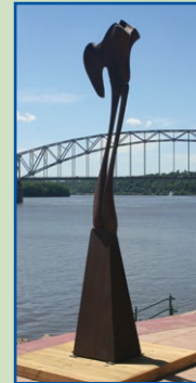
Orion Sam Spiczka - Sauk Rapids, MN Cor-ten weathering steel 2.5' x 10' x 1.5' 250 lbs. $16,500