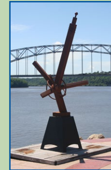
Long Shot Nathan Pierce - Cape Girardeau, MO 1/8" steel, natural weathered patina 5' x 10' x 5' 250 lbs. $6,000

Consider purchasing one of the 2017 Art on the River sculptures before they leave town in June of 2018. Near the end of the exhibit, artists are already making plans for where the sculpture will be the following year, so start thinking now about a purchase.