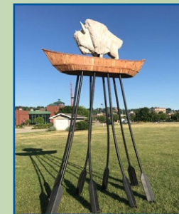
Harbinger - White Guide Jeremy Rudd - Dyersville, IA 1/8" walled steel tubing, 14g steel, patina, steel armature, cedar wood 8' x 13.3' x 4' 1,000 lbs. $12,500

For additional information, visit www.cityofdubuque.org/artontheriver or contact the City of Dubuque Economic Development department at 563-589-4393 or artontheriver@cityofdubuque.org .