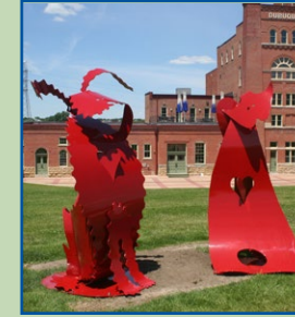
Diversity Love Gail Chavenelle - Dubuque, IA 3/16" and 1/4" mild steel plate, baked powder coated finish 7' in height 200 lbs. $11,500