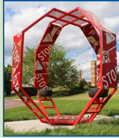
Pod Stop Greg Mueller - Drayton, SC powder coated steel, 1/8 square tubing, decommissioned signs, repurposed tires 10' x 10' x 10' 600 lbs. $5,200