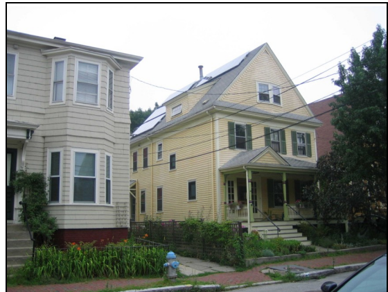
These solar panels low profile and location make them unobtrusive even though they are visible from the public right of way.